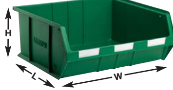
CP6 W x H x L (mm) 416 x 175 x 375