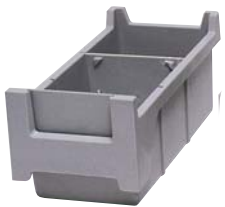
DU1 138W x 281L x 128Hmm

Available in three sizes, and coloured Light Grey. Provision for sub-division with purpose-made Light Grey Plastic Dividers.