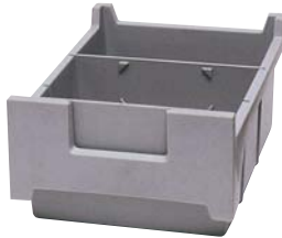
DU2 207W x 281L x 128Hmm