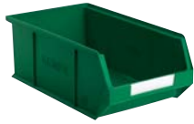
CP4 W x H x L (mm) 207 x 130 x 350