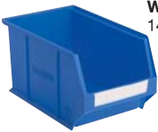
CP3 W x H x L (mm) 148 x 130 x 240