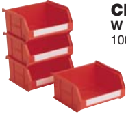
CP1 W x H x L (mm) 100 x 50 x 90

STANDARD PLASTIC CONTAINERS Sizes all available in 4 colours: Red, Blue, Yellow, Green. Made from co-polymer polypropylene.