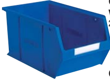
CP5 W x H x L (mm) 207 x 175 x 350