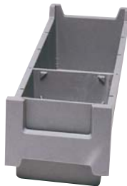
DU3 138W x 431L x 128Hmm